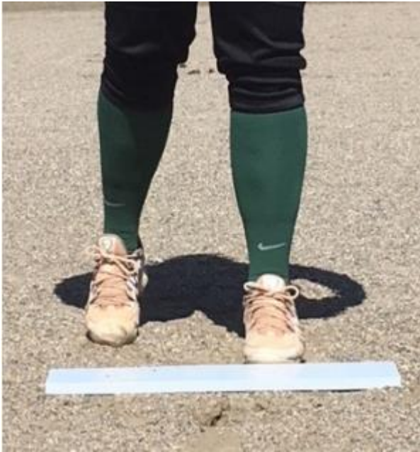
Pic 2. Legal placement