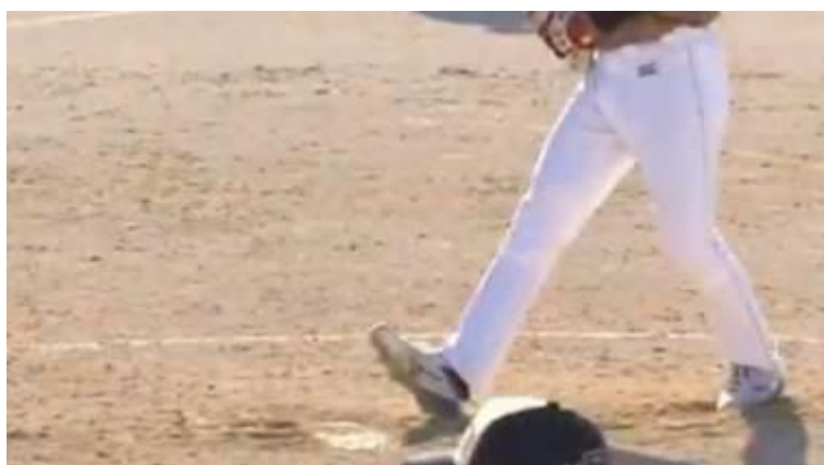
Pic 1. Legal lift of the toes.

The below is not a definitive set of legal positions, just some of the more unusual ones.