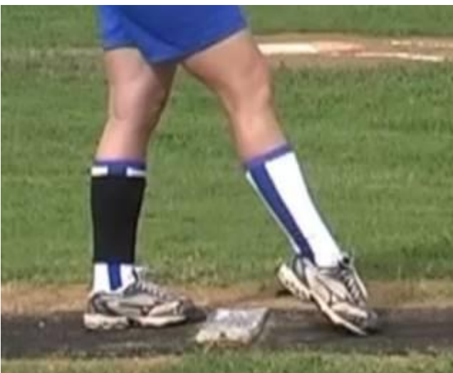
Pic 3. Legal Heel lift