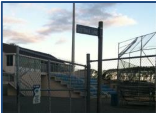
Photo: Dusk descends on Softball Lane in Christchurch

Once bat checks are conducted for those teams arriving tonight, we head off for dinner and I can highly recommend the Canterbury Honey Chicken at Speights on Bealey Ave. After ten days of mid-30's in Melbourne I am struggling to adjust to the cold of Christchurch. The clean and comfortable accommodation was at Abbey Motor Lodge about 15 mins drive from the ballpark. Eight or so umpires had gathered in our room and a get-to-know-your-crewmates session proved to be a great bonding exercise. A good night's sleep and we are off to the grounds at 7am the next morning.