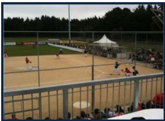
Photo: A view of the Grand Final from upstairs - Auckland United vs. Hutt Valley Dodgers

The NZ crew was a fantastic bunch of guys to work with, and I felt very welcome and embraced into their family. To hand out my tour gifts I ran a fun Aussie Trivia Quiz, and was presented with gifts of my own to bring back - a silver-fern cap, NZ badge and a traditional Maori weapon, a Patu. With Finals day finished, we took a quick tour of Christchurch as we dropped other umpires at the airport.