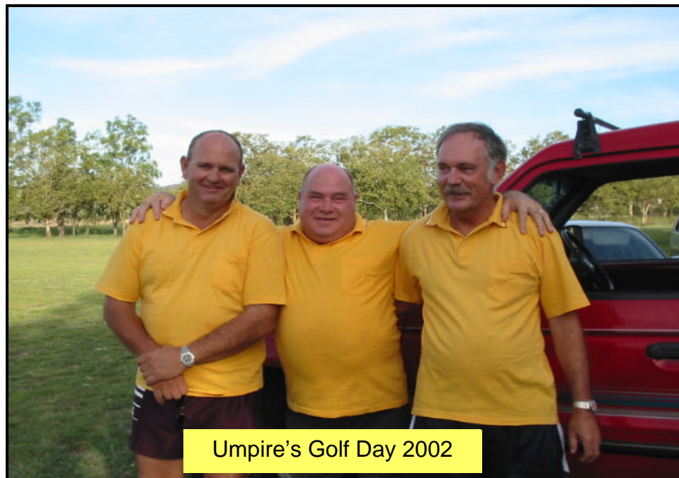
Umpire's Golf Day 2002

I know he will be missed, but the atmosphere of the public service on Friday 28 April, demonstrated that his spirit will live on in the hearts of all that knew him.